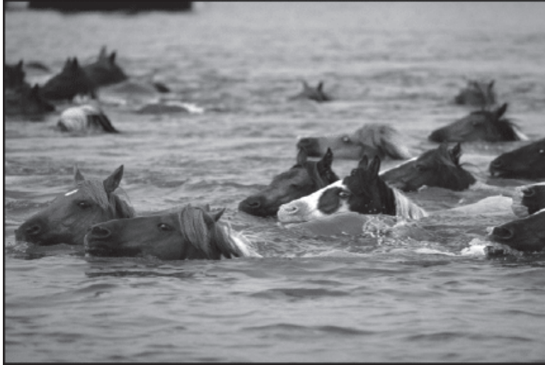
Photograph of wild Chincoteague ponies swimming the Assateague Channel (# ngs12_0248)